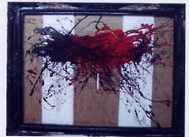
"8:46" (2008) Mixed media - 100 x 140 cm

On this painting, the two white towers represent the innocence of the victims, the white and black disc behind expresses the worldwide impact of the event, either received as an abomination by most of the population (white) or as an achievement by a few (black). The frame is broken like the scars of 9/11 left throughout the world. The white halo behind the tower is the hope for a better future and peace, but an allegory of the devil on the top part of the frame expresses that the devil is never that far away. It is present in all Ghass paintings.